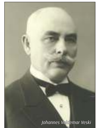
Johannes Voldemar Veski